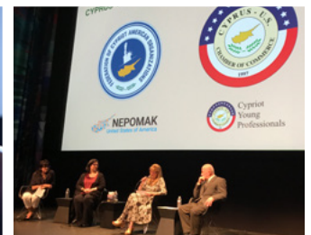
Panelists at Cyprus 44 Years Later